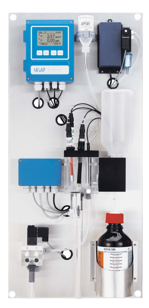
Monitor AMI Sodium A Data Sheet No: DenA2445XXX0