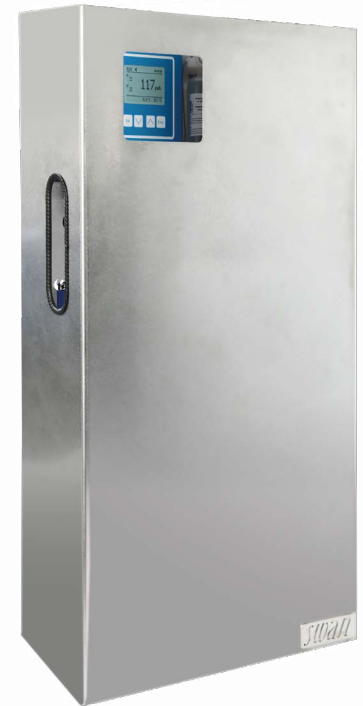
AMI LineTOC with removable stainless steel enclosure (on request).

Clearly arranged components and menu-based operation via transmitter makes the analyser fast and straightforward to handle. The exchange of the UV-reactor can be done quickly and on-site by the operator. The included function test can automatically verify the proper operation of the instrument in selectable intervals or upon request.